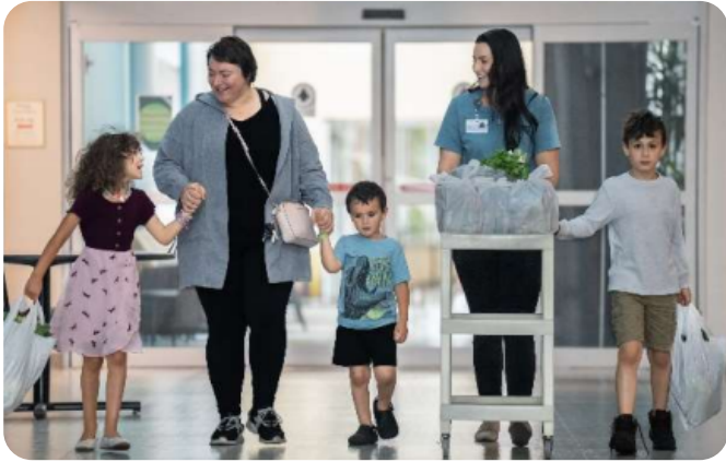
A food pharmacy guest brings healthy food home. (Blue Ridge Area Food Bank, Verona)