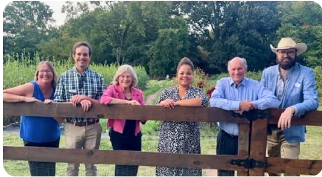
Food access advocates at the Virginia Food for Virginia Families Reception

The Federation advanced food access policy through advocacy and partnerships, securing a seat on the newly-formed Virginia Commission to End Hunger . As leaders of the cross-sector Virginia Food Access Coalition , we work with more than 100 advocates to build support for legislation that will: